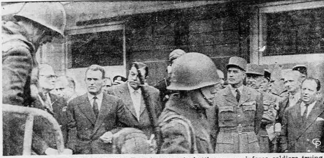
DISSEMBLING AT ALGIERS, French troops in battle array reinforce soldiers trying to cope with rebellion. Robert Lacoste (right background), new French resident general, has just flown back from Paris with authority to smash rebels.