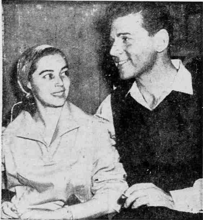
FILM PAIR WEDS —Marisa Pavan and Jean Pierre Aumont, Hollywood film personalities, left San Francisco International airport last night for a honeymoon in Hawaii following their marriage in a civil ceremony in Santa Barbara, Calif., yesterday.