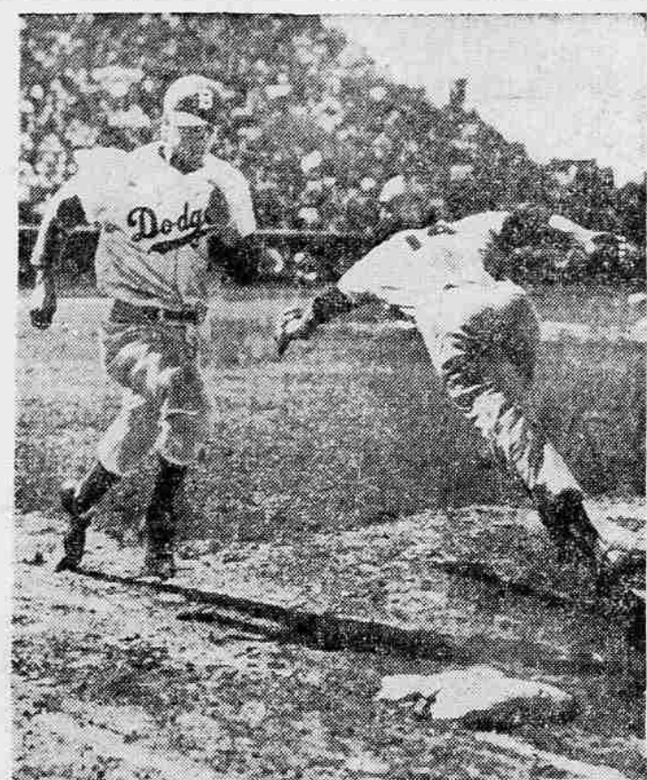
SAFE—Dodger shortstop Pee Wee Reese (left) is safe at first in the third inning of Yankee-Dodger exhibition game at Miami, Fla., as a wide throw pulls Yankee first baseman Bill Skowron off the bag. The Yanks won, 5-0.