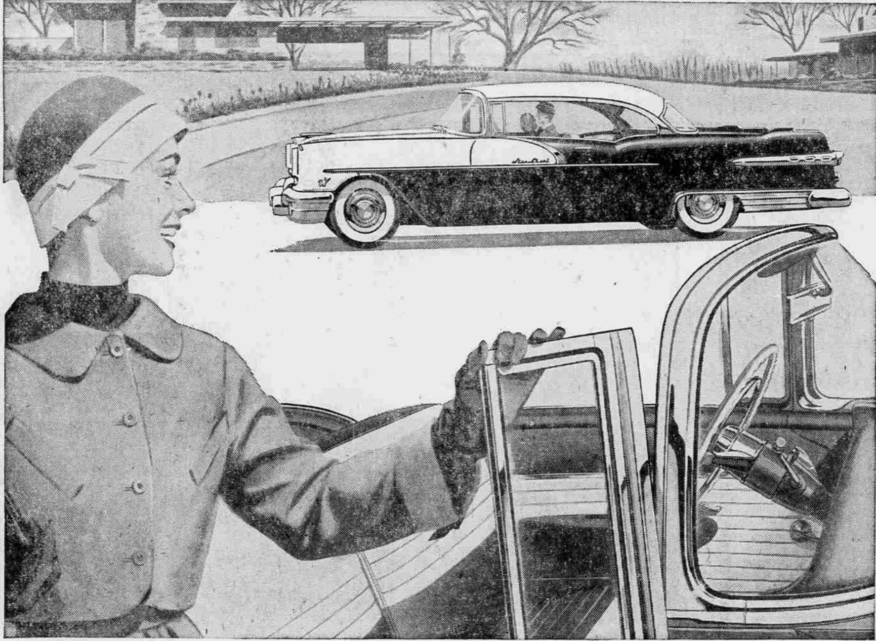
STAR CHIEF TWO-DOOR CATALINA