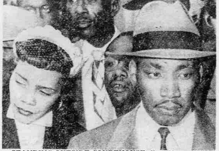
STANDING OUTSIDE COURTHOUSE, Rev. Martin Luther King and wife (left) discuss issues of his trial on charges of boycotting Montgomery, Ala., bus line. Negroes are refusing to patronize utility because they say seats are reserved for whites while Negroes are obliged to stand.

MONA FREEMAN SAYS "If you want to have a lovely figure, I recommend Ayds!" AYDS VITAMIN AND MINERAL CANDY WAINSCOTT'S PHARMACY 322 E. Main Ph. 2-6440