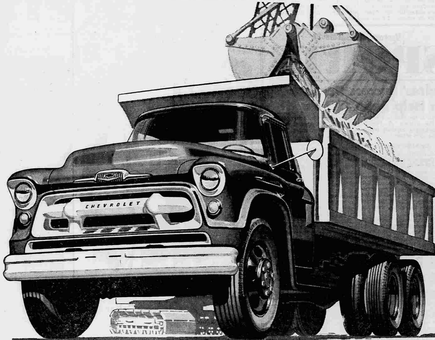
New Heavyweight Champs—with modern short-stroke V8 power!