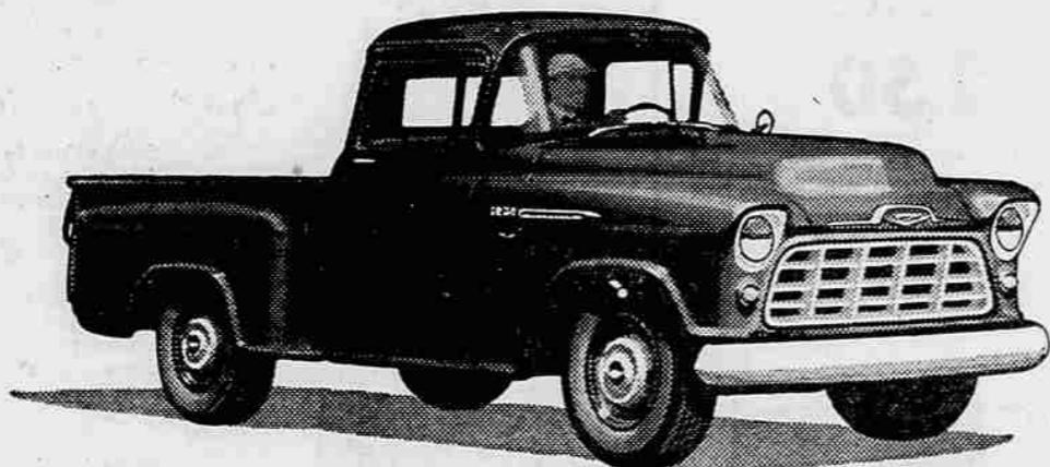
New Lightweight Champs—with High-Level ventilation and concealed Safety Steps!

In new Task-Force six-wheelers you get the last word in modern V8 power with the big new 322-cubic-inch Loadmaster. You get Power Steering, too! And a built-in 3-speed power divider lets you select the most efficient ratio for a wider range of operating conditions. With the tandem's 5-speed transmission, this gives you 15 forward speeds and 3 reverse! New rear suspension eliminates the