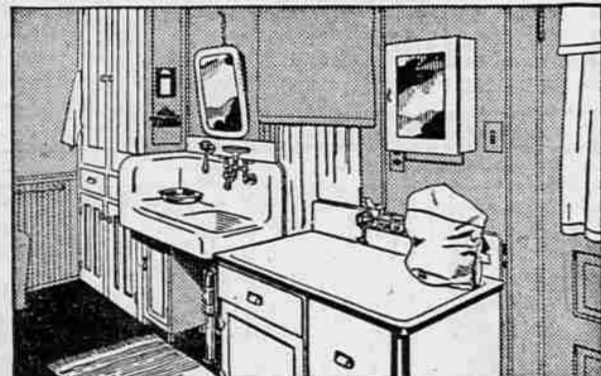
If your kitchen looks something like this . . .