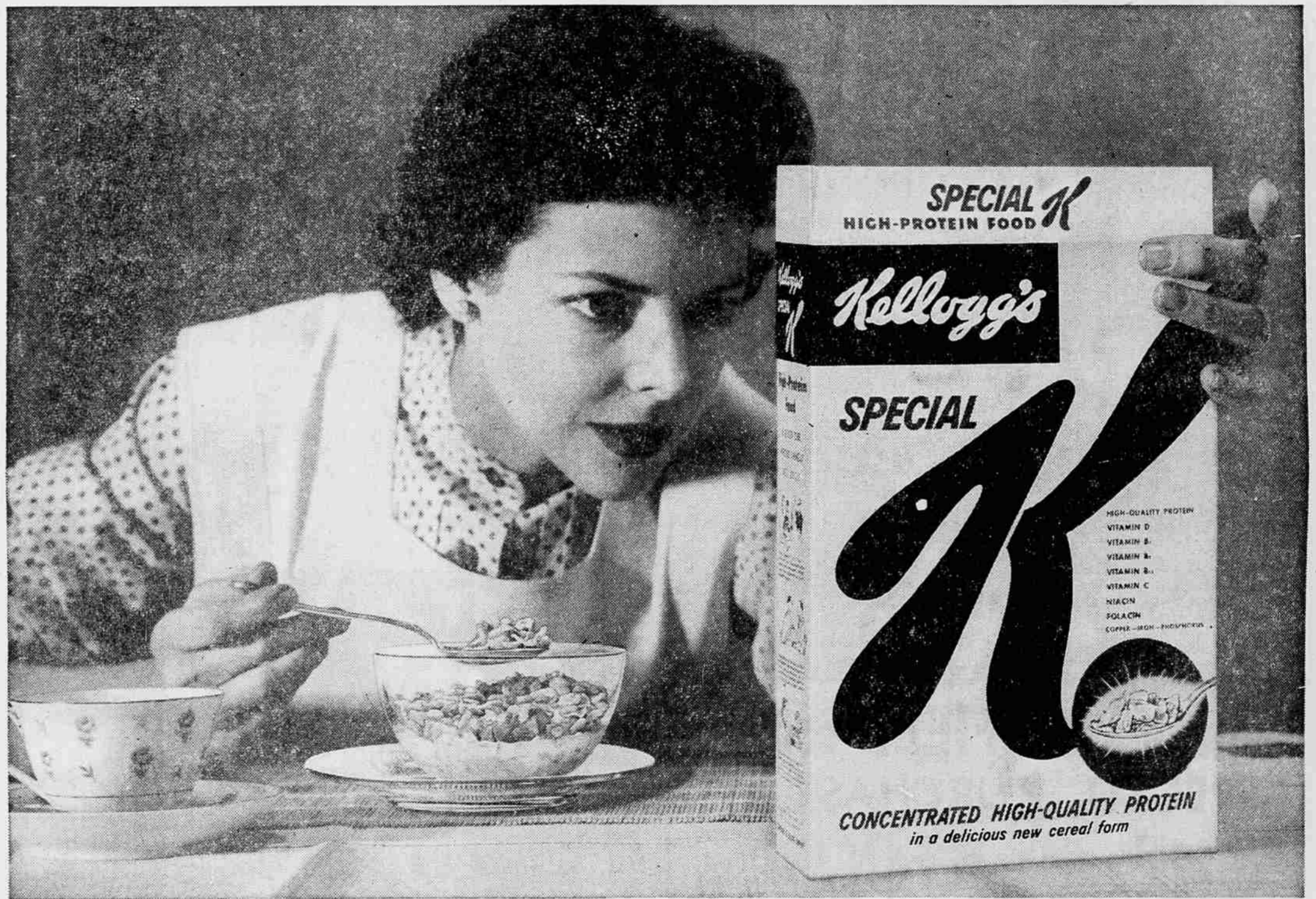
This intent lady is reading the most nutritious cereal story of our time. You can read about it on the back of the Special K package.