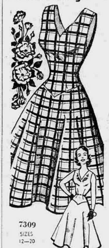
7309 SIZES 12-20 by Alice Brooks

This flattering new dress—fashion "must" for summer! Iron-on flowers—take just seconds to spark the neckline with gay color! Pattern 7309: Misses sizes 12, 14, 16, 18, 20. Tissue pattern, washable iron-on transfers in combination of pink, green, State size. Send TWENTY-FIVE cents in coins for this pattern — add 5 cents for each pattern for 1st-class mailing. Send to Medford Mail Tribune, Household Arts