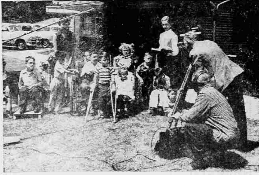
Children at Children's Hospital school, Eugene, appeared in a film "This Is Their Story" and are shown above during the movie-making. The hospital school, in operation for 10 years, has grown steadily and has a skilled staff. Progress of the school, financed by the annual Easter Seal sale, is carefully watched by educators.