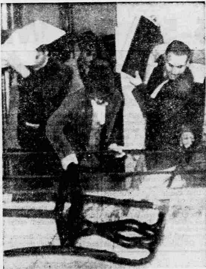
TOSSING FURNITURE from balcony of British consulate in Crete, Greek students protest deportation of Archbishop Makarios from Cyprus in upheaval over demands Britain relinquish control of Greek-claimed island.

The Panama Canal was opened to ship traffic Aug. 15, 1914.