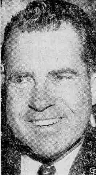
SMILING broadly, Vice President Richard Nixon is happy to hear President Eisenhower say he'd like Nixon as 1956 running mate.

Construction is to start 15 days after an award is made.