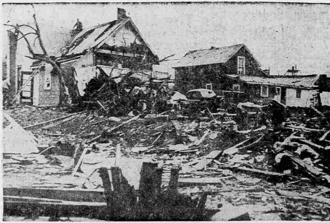
IN THE WAKE OF THE WIND —Homeowners at Marion, Ind., returned to this scene of desolation and ruin to begin the discouraging task of clearing away debris, patching roofs and rebuilding houses. Several persons in these two houses were injured when the tornado struck. One person in Marion was killed.

Wisconsin paid bounties on 38,597 fox, 2,579 wolves and coyotes and 524 lynx and wildcats in 1954-55.