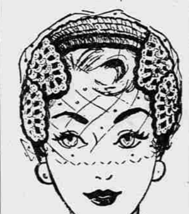
3787 by Alice Brooks

Perfect accessories for your new summer outfit—this pretty hat and handbag ensemble! Quick to make in favorite pineapple crochet—lovely styles to own!