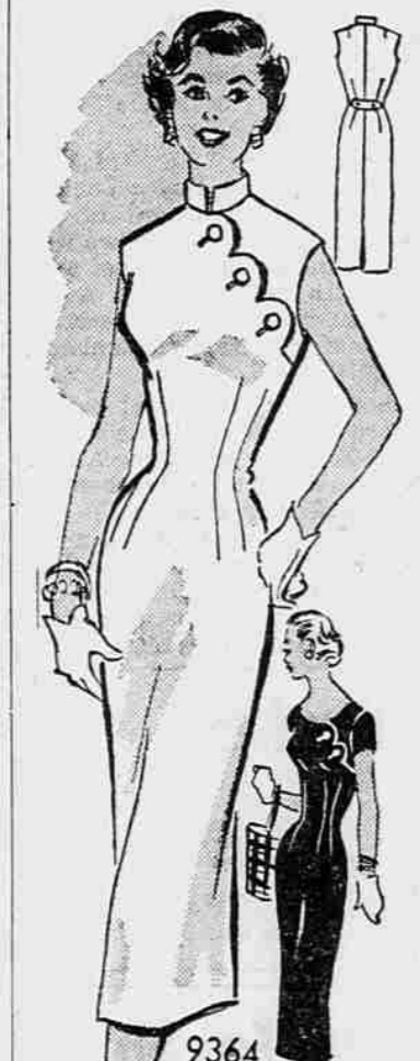
9364 by Marian Martin

Fashion shows a far-eastern influence—in the siren-slim lines of this newest dress. It's beautifully fitted (even without a belt)—famous for its figure-flattery! Have it now with tiny mandarin collar; make a cool scooped-neck version for summer!