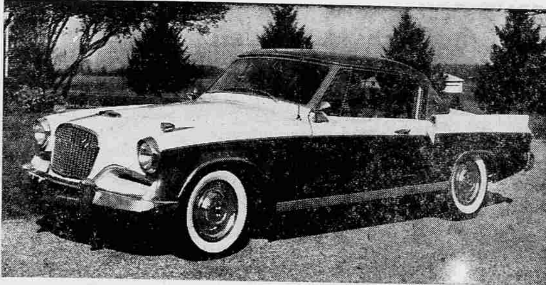
GOLDEN HAWK —The Golden Hawk, new Studebaker sports car, will be among models on display at the grand opening tomorrow of DeLeigh Motors, Studebaker car and truck agency, 134 South Riverside ave. The Golden Hawk, highest powered car in the low-price class for 1956, has a 275-horsepower, 352-

Travel and Adventure: Western Germany, Gibbon; Seven men among the penguins, Marret; Adventures in good eating, Hines; Lodging for a night, Hines; South Africa, Marquand; India, Rawlinson; The Netherlands, Sitwell; Scandinavia, DeMare; the land of Italy, More;