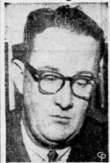
PROBLEM OF deciding whether John Graham, Denver airline saboteur, will be tried with or without a jury is faced by District Judge Joseph McDonald. Graham asked that a jury be waived. (International)

PORTLAND LIVESTOCK Portland — (U.P.) — Cattle 200. Choice steers $12.25-13.50; choice fed heifers $16.50-17; canner-cutter cows $8-9.50; few $10; utility cows $10.50-12; commercial $12.50-12.75; utility bulls $8-12. Calves 50. Choice vealers around $28-30; utility-low commercial vealers $11-15; around 450 lb. calves around $18. Hogs 150. U.S. 1 and 2 butchers 180-225 lbs. $14.50-15.25. No. 4 butchers $14; sows, 300-500 lb. $10-12.50. Sheep 50. Choice fed woolled lambs $19; good-choice slaughter lambs $17-18; some $18.25; good-choice ewes $5.50-7.