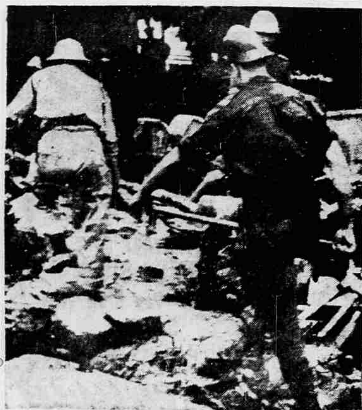
LANDSLIDES HIT BRAZIL TOO—Brazil has joined the many countries throughout the world suffering from tragic landslides. Here rescuers carry out a victim who was trapped in home demolished by landslide caused by torrential rains in coffee-growing town of Santos. Thirty persons lost their lives and the toll is expected to go higher.