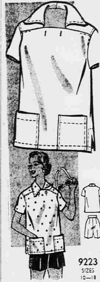
9223 SIZES 10-18 by Marian Martin

You're so smart to sew these new fashions now — for sunny summer days! Carefree T-shirt with a clever convertible neckline — slim, trim shorts below. Perfect in gay striped denim, poplin, pique — or use no-iron seersucker for shortie pajama versions! Pattern 9223: Misses' sizes 10, 12, 14, 16, 18. Size 16 shirt, 2 1/2 yards 35-inch; shorts, 1 1/2 yards. This easy-to-use pattern gives perfect fit. Complete, illustrated sew chart shows you every step. Send THIRTY-FIVE cents in coins for this pattern — add 5 cents for each pattern for 1st-class mailing. Send to Marian Martin, care of Medford Mail Tribune, Pattern Dept., 232 West 18th St., New York 11, N.Y. Print plainly NAME, ADDRESS, SIZE and STYLE NUMBER.