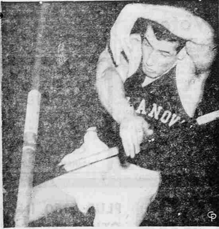
CLEARING BAR at 15 feet 5 inches, Villanova's Don Bragg sets new Madison Square Garden pole vault record during Knights of Columbus games in New York. Rev. Robert Richards withdrew because of pulled leg muscle.