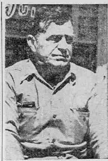
LAST OUT—Fred Merkle, who played in five World Series and who never lived down one of baseball's classic "boners," died at Dayton, Fla. He was 67. With the Giants in 1908 in crucial Series game against the Cubs, Merkle "forgot" to touch second base. It cost the Giants the pennant and earned Merkle nickname of "Bonehead."

Brazil has 7,000,000 horses, Russia about 16,000,000.