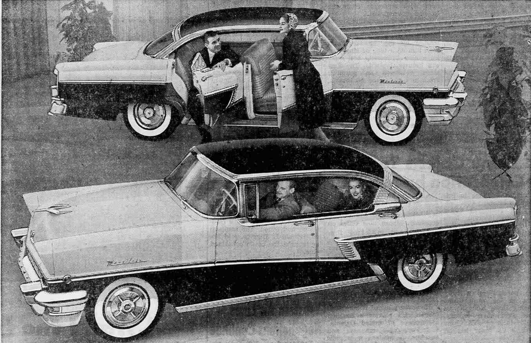
THE NEW MONTCLAIR AND MONTEREY PHAETONS—No center pillars, of course. But more important, no view-cramping curve of the roof—only the whole wide world to see.

Newest, most advanced design in 4-door hardtops. Available in Montclair, Monterey, or Custom series.