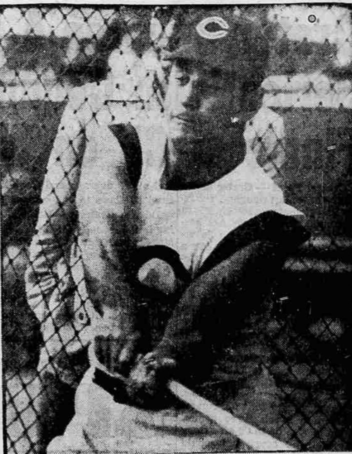
BIG LEAGUE FASHION—The stylists have entered the baseball diamond with this newly designed sleeveless shirt that Cincinnati will feature this year. Big Ted Kluszewski models the blouse as he takes his cuts in the batter's cage at the Redlegs training camp at Tampa, Fla.