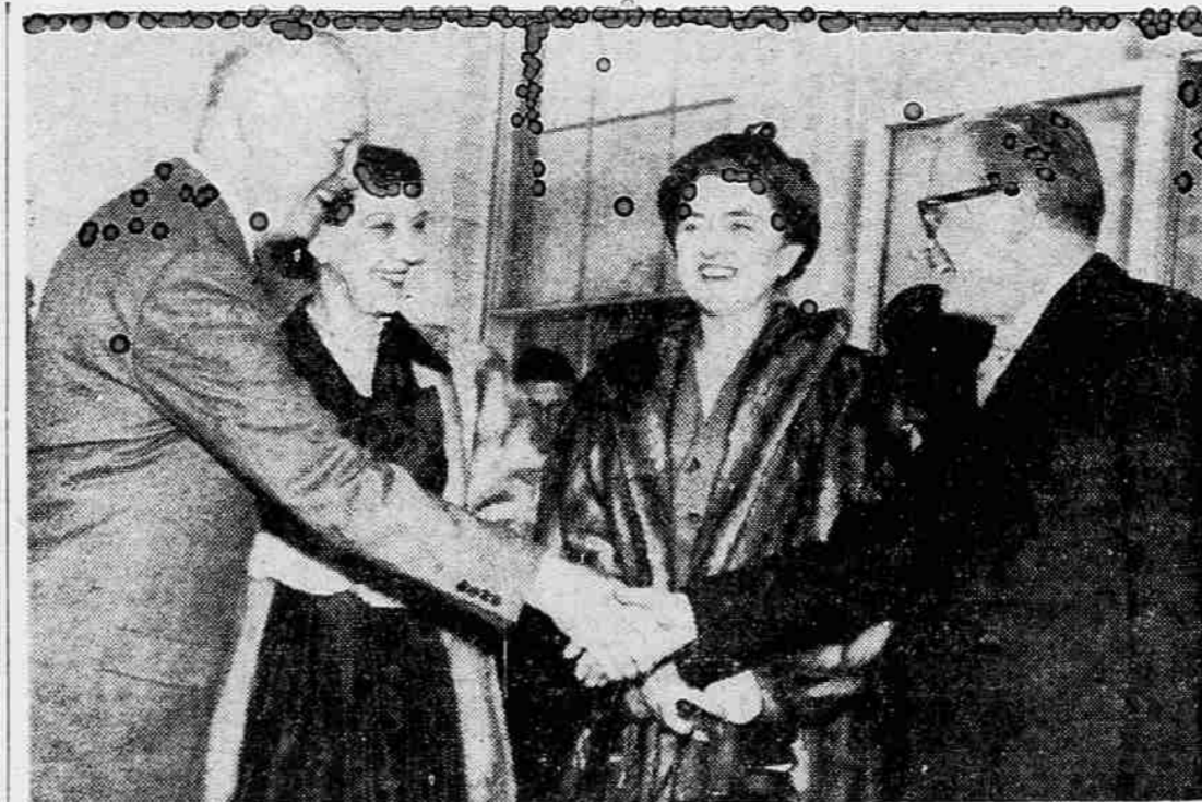
OFFICIAL WELCOME —President and Mrs. Eisenhower greet Italian Pres. Giovanni Gronchi and his wife on their arrival at the White House. The Italian Chief Executive is here on an historic 16-day goodwill visit to the U. S. and Canada.

Even without the polish which the remaining performance of tonight, Friday and Saturday are sure to have the "Holiday Revue" makes an enjoyable evening and no one can fail to appreciate the efforts of the Medford Kiwanis club.