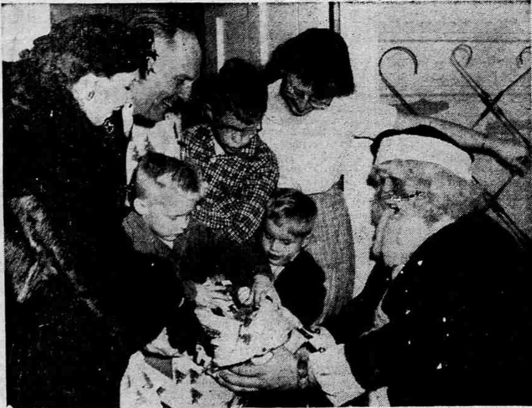
GETTING HELP from Governor and Mrs. Goodwin J. Knight (left), Santa Claus distributes gifts to Yuba City, Cal., children. The city was inundated December 24 by raging waters of Feather and Yuba rivers, postponing Santa's visit until now.