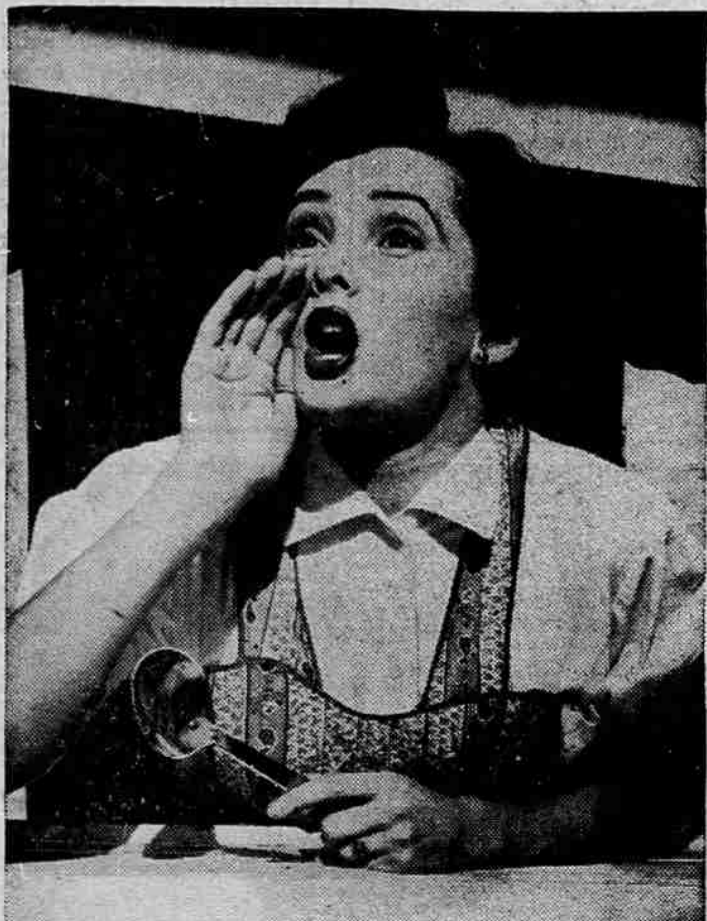
Where's that boy! Youngsters always disappear just about dinner-time? Well, you've most likely discovered how to save your voice at times like this . . . by phoning around the neighborhood for them. This is another of the "chores" the telephone has taken over in this day and age. And after all, that's what it's for. The men and women of Pacific Telephone work to make your telephone more useful every day.

The patients were the 451st, 452nd and 453rd carried by planes of the non-profit air ambulance corporation in the past six years.