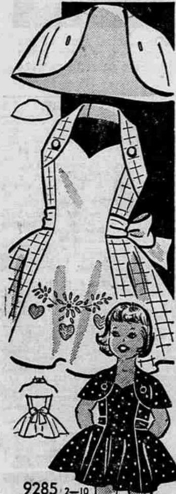
9285 2-10 by Marian Martin

Two pretty ways she can wear this style! Cool halter-neck sundress in graceful princess silhouette; or a "Sunday best" ensemble with button-on capelet! Use gay remnants of check and plaid; add colorful embroidery!