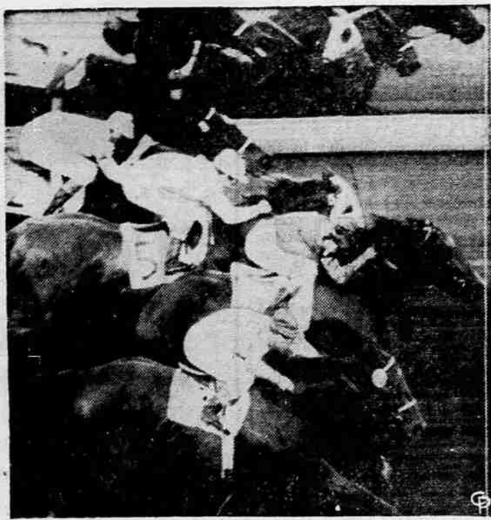
CAMERA TELLS STORY of Nashua's victory in Widener Race at Miami's Hialeah track. Horses front to back are: Social Outcast, Nashua, Sailor and Find.

Washington — (U.P.) — Rep. Torbery H. MacDonald's (D-Mass.) bill to provide for government reimbursement to U. S. Olympic athletes for certain travel and training expenses has been referred to the House foreign affairs committee. The bill would have the government reimburse any athlete for his travel and other expenses at the training site selected by the Olympic association.