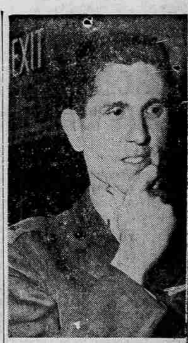
SUSPENDED—The symbolism of the "Exit" sign seems to escape Marine Lt. Wes Santee as the ace miler reflects on his life suspension by the National AAU. The suspension was announced in New York and cited Santee's alleged acceptance of $1500 in excessive expense money.

Sowell, who collects progressive jazz records when he's not setting records of his own by pounding the cinders and indoor boards, successfully defended his National AAU 1,000-yard championship last Saturday night.