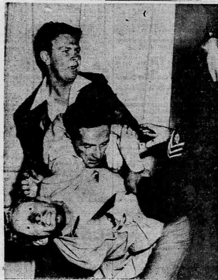
LIVELY POLITICS —It's election time in Australia and tempers are high. This bearded official of the Australian Party was sent over backward by a heckler who didn't like the way he was told to be quiet or leave a campaign meeting in Sydney. A policeman had to step in to restore order at the meeting, conducted by Frank Browne, Australian Party leader.

The Dalles Council Approves Fluoridation The Dalles—(U.P.)—The Dalles city council has voted unanimously to adopt fluoridation of the city's water supply. The action was taken at a regular meeting Monday night following approval of city PTA groups. The council decided to withhold installation of equipment until after the first of July in order that the cost will go into the budget of the next fiscal year.