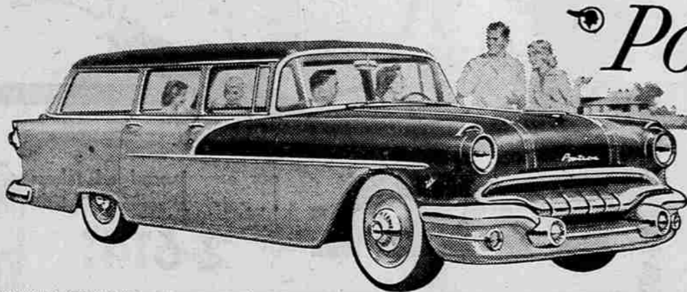
870 4-DOOR, 2-seat, rear seat folds flat for 7 1/2' carrying space with gate closed, 9' gate open.

Come in soon—let us show you why these fabulous '56 Pontiacs are rated America's best station wagon buys! *An Extra-Cost Option