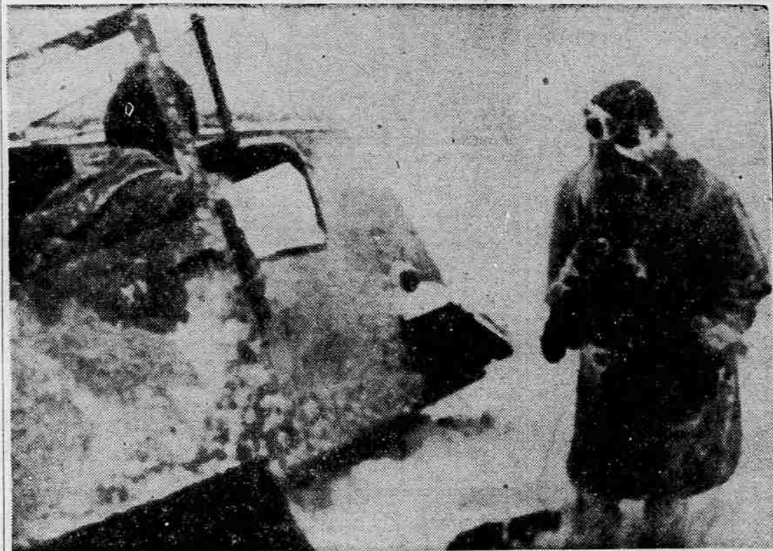
ADLAI HAS A CLOSE CALL —Adlai Stevenson (right) surveys the overturned snow tractor in which he and five others narrowly escaped injury while sightseeing on Mt. Hood above Timberline Lodge, Ore. The tractor, called a "Sno-Cat," hit a cornice partially covered by snow, turned turtle and slid down a 35-foot icy ravine. The cab of the tractor was dented, but none of the party suffered more than a little shaking up.