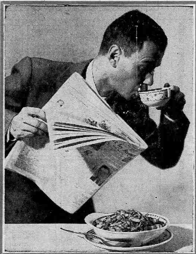
Protein starts your day right. In Kellogg's Special K, folks in a hurry get the high-quality protein needed for sustained activity. Nutritionists say Special K is one of the most nutritious cereals ever put in a package.