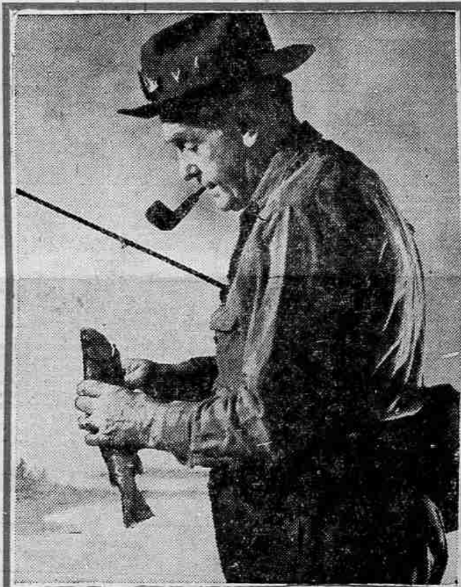
Protein helps keep you young for years longer. Kellogg's Special K contains plenty of high-quality protein in easily digested form. Unusually appealing to eat, Special K also helps stir up lagging appetites.