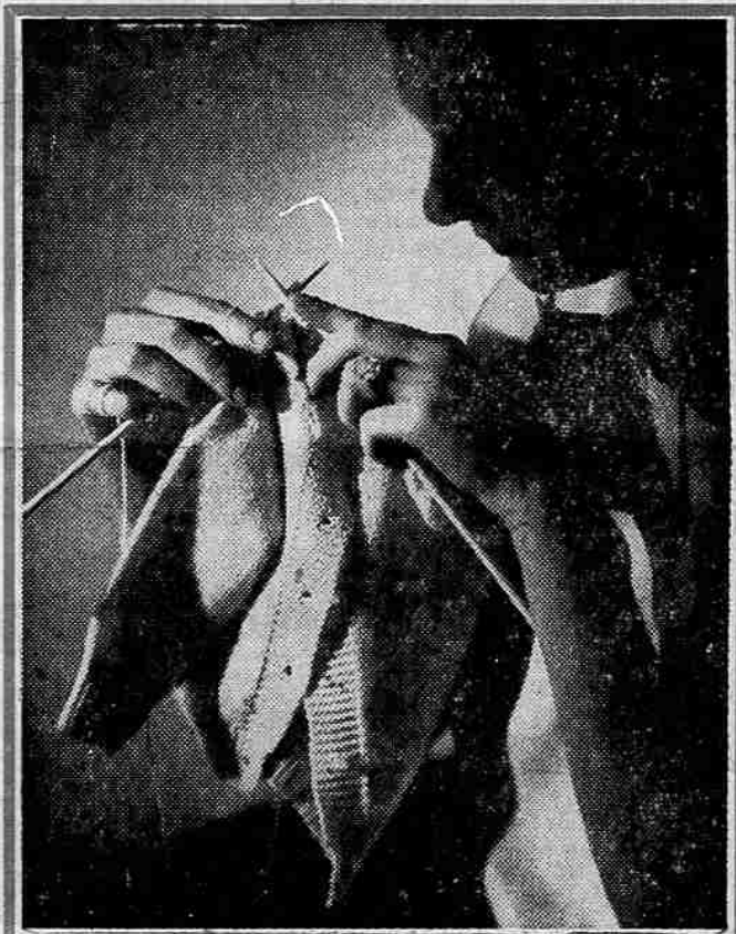
Protein helps bring healthy babies. Expectant mothers require far more protein than usual. Kellogg's Special K supplies the kind of high-quality protein needed—more than any other leading cereal—hot or cold.