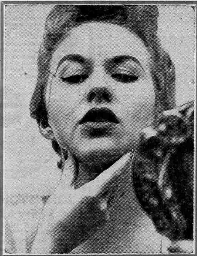
Protein helps you reduce. Concentrated, high-quality protein—the kind in Kellogg's Special K—is satisfying food. Yet there are only 105 calories in an average 1-ounce serving of this delicious new protein cereal.