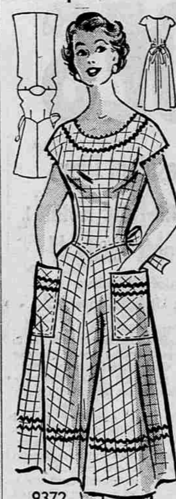
9372 by Marian Martin

Add a bright spring look to your daytime wardrobe — sew this smart frock for around-the-house activities! Especially designed to flatter the larger figure—in sizes up to 50! Sew-very-easy; you're sure to want several in gay cotton checks and prints! Start sewing now!