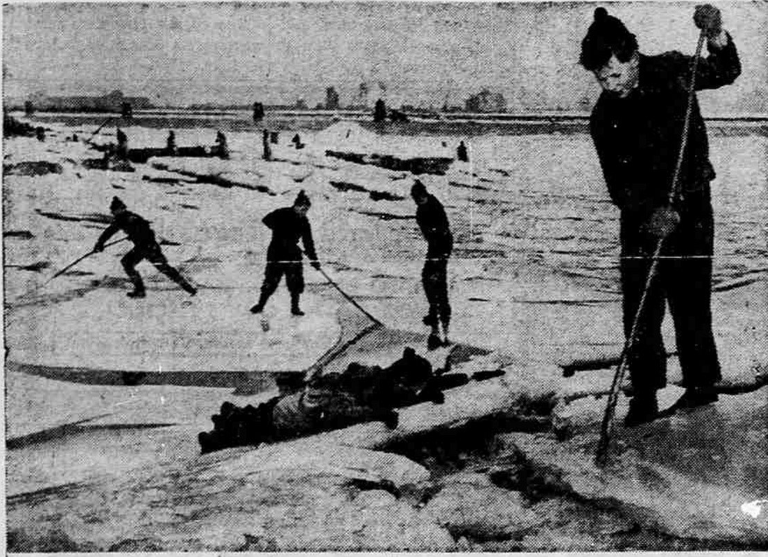
BOYS WILL BE BOYS —The death toll in cold-weather-plagued Europe is now nearing the 600 mark as a new threat develops. Victims of the worse European winter of the century now face a threat of floods as ice-choked rivers begin to back up. Here German youngsters at Hamburg, with a child-like unawareness of the critical situation, play happily on the huge block of drift ice on the shore of the Elbe River.