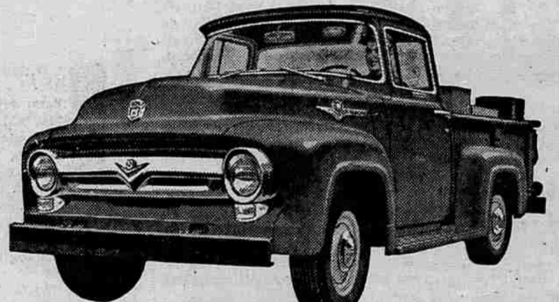
NEW FORD F-100 8 FT. 1/2-TON PICKUP, GVW 5,000 lbs. Choice of 133-h.p. Six or 167-h.p. V-8.