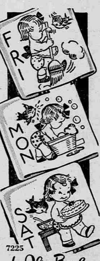
by Alice Brooks

Brighten household chores with these cute motifs! Easy to embroider on kitchen towels—cheerful "helpers" every day of the week!