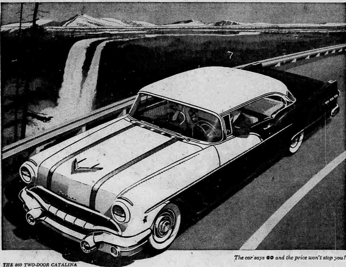
THE 860 TWO-DOOR CATALINA

FREE FLOOR LAMP with any LIVING ROOM SET FREE TV TRAY with any ROCKER ● Used Furniture ● Trade-Ins ● Free Delivery ● Many More Items EASY TERMS