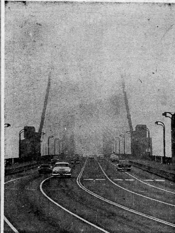
RIGHT ON SCHEDULE —No London bridge falling down is this but San Francisco's Golden Gate Bridge being obliterated by fog rolling in after the Bay Area enjoyed a week of sunshine. View is from the San Francisco side looking north toward Marin County. The cables rise to meet the first tower and disappear right before your eyes.