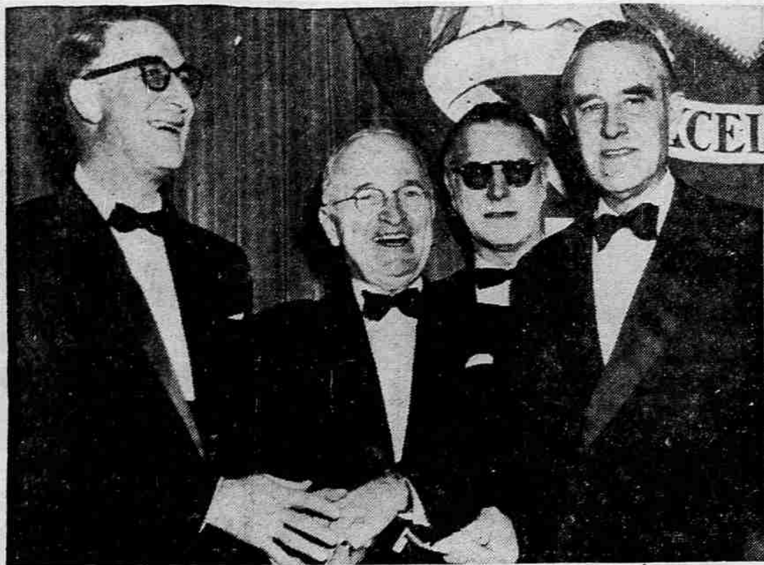
HAIL, HAIL, THE GANG'S ALL HERE!—Prominent Democrats, left to right, Senator Estes Kefauver of Tennessee, former President Harry S. Truman and New York Gov. Averell Harriman engage in a three-way handshake at the New York State Democratic Committee's annual fund-raising dinner in New York City.