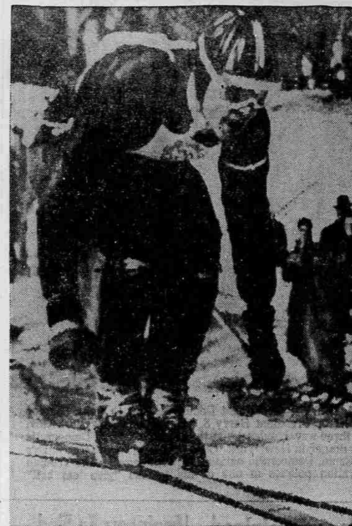
CHAMPION OF CHAMPIONS —Toni Sailer, 20, of Austria swoops downhill to complete the greatest ski performance in Olympic history by winning his third gold medal of the 1956 winter games in a nightmarish race down the icy Tofano slide at Cortina, Italy. Several of the star downhill ski racers in the event were sent flying off the beaten track by huge bumps and a 40-mile-and-hour wind blowing off the Dolomite Mountains.