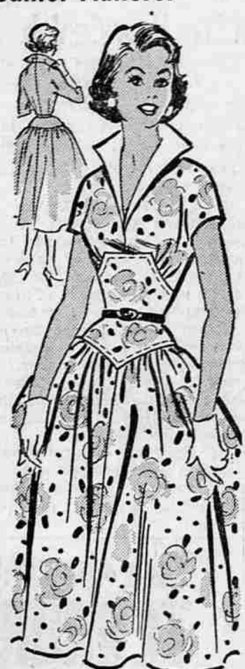
9210 SIZES 9-17 by Marian Martin

Soft flattery for the Junior figure — yours to sew, in this newest spring frock! Fitted bodice, flaring skirt; tiny waistline beautifully accented above and below. Choose a pretty cotton print, lustrous silk—make this dress the star of your wardrobe! Pattern 9210: Jr. Miss Sizes 9, 11, 13, 15, 17. Sizes 13 takes 5 1/2 yards 35-inch; 1/2 yard contrast. This easy-to-use pattern gives perfect fit. Complete, illustrated Sew Chart shows you every step. Send Thirty-five cents in coins for this pattern—add 5 cents for each pattern for 1st-class mailing. Send to Marian Martin, care of Medford Mail Tribune, Pattern Dept., 232 West 18th St., New York 11, N.Y. Print plainly NAME, ADDRESS with SIZE and STYLE NUMBER.