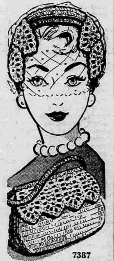
7387 by Alice Brooks

Perfect accessories for your new Easter outfit—this pretty hat and handbag ensemble! Quick to make in favorite pineapple crochet—lovely styles to own!