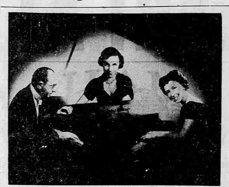
AMERICAN PIANO TRIO