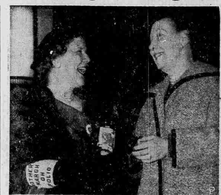
MAKING FIRST contribution to "Mothers' March on Polio," Mrs. Mamie Eisenhower (right) greets Mrs. Earl Warren, wife of Chief Justice of Supreme Court.

rd., east on Barnett rd. to North Phoenix rd., North Phoenix rd. to Hillcrest rd.