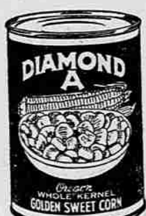
NO. 303 CAN