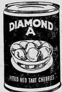
NO. 303 CAN