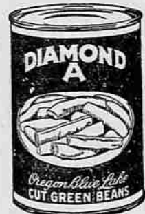
NO. 303 CAN