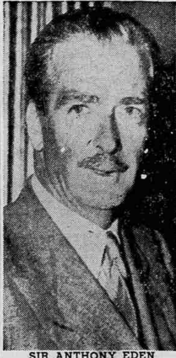
SIR ANTHONY EDEN Lunches with President

The Prime Minister's meeting with Mr. Eisenhower will be their first since last summer's Big Four summit meeting at Geneva.