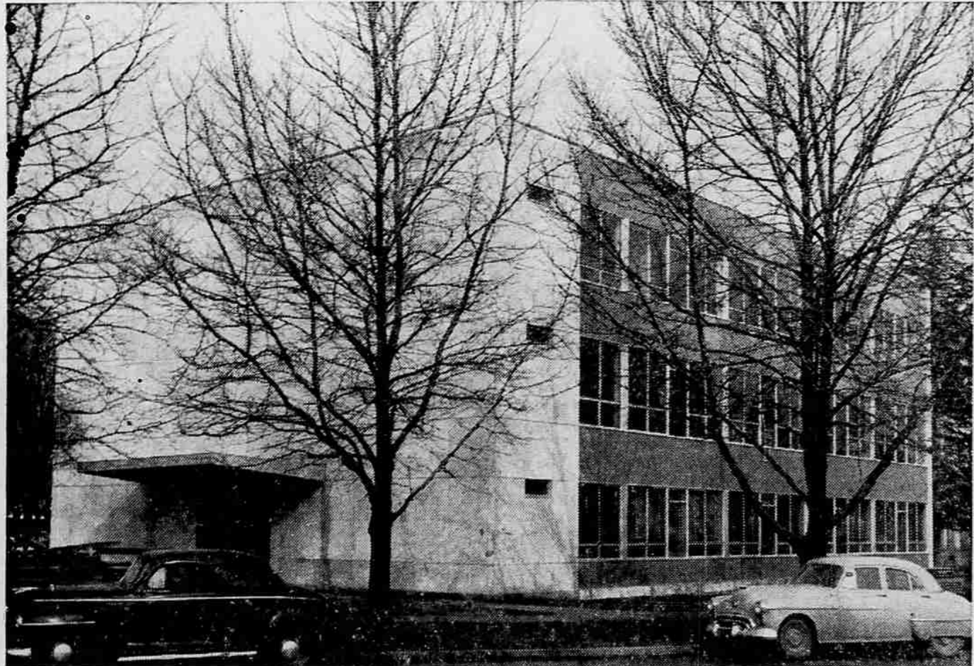
Several county departments have already moved into new quarters in the annex of the county courthouse. Erected at the back of the main building, the annex is bordered by Laurel and Eighth streets, and has an entrance on the former street. Of fireproof construction, the addition is designed with large windows of tinted glass to provide ample light for workers. Work is continuing on the interior of the third floor, which will house a circuit courtroom and offices for court officials. The basement of the annex will be used for storage.