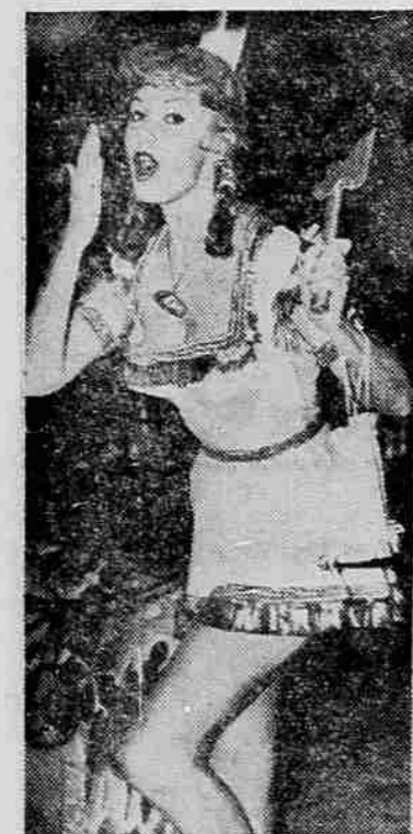
PAGING RHOHONTAS — Actress Rhonda Fleming stages her own victory dance after she was awarded first prize for this white Indian costume at the annual Golden Nugget Ball at Palm Springs, Cal. The affair is held for benefit of charity.

The current prices, economists figure the average industrial worker earns the price of a pound of round steak in 29 minutes. In 1929 it took 49 minutes.