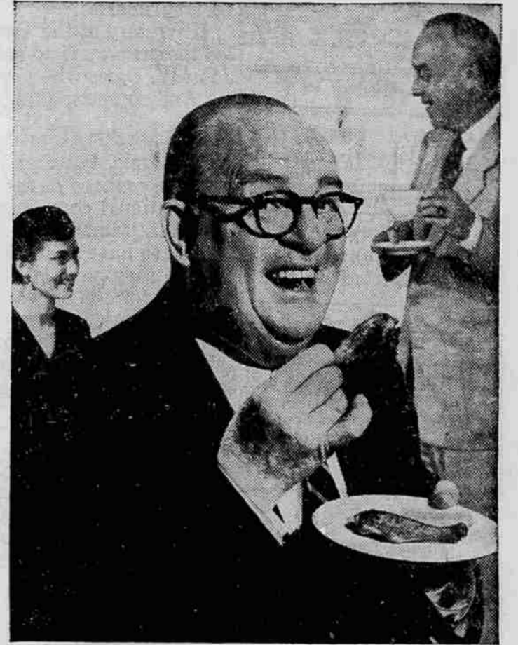
Mighty tasty! What goes better after an evening get-together than fried chicken? More than likely you've discovered how easy—and how much fun—it is to phone up and have it delivered hot to your door. Your telephone's mighty handy that way. And after all, that's what it's for. The men and women of Pacific Telephone work to make your telephone more useful every day.

Robertson School of Business 40-42 N. RIVERSIDE Phone 3-4264