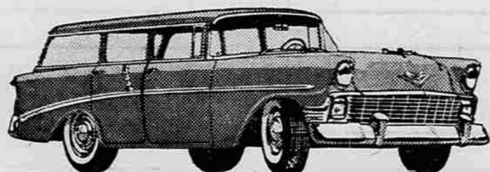
"Two-Ten" Beauville—4 Doors, 9 Passengers Section of middle seat folds for easy access to rear!

power and performance to prove that! A zippy, exciting kind of power that's fun to handle. And the closest thing to sports car performance you'll find in a full-size automobile. It's a real road car, and safer because of it! Come in for a ride and see.