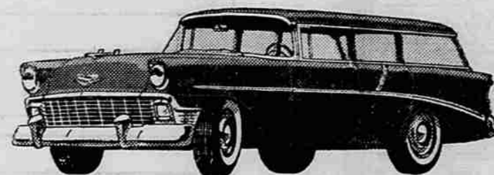
"Two-Ten" Townsman—4 Doors, 6 Passengers Washable, all-vinyl interior lasts and lasts!