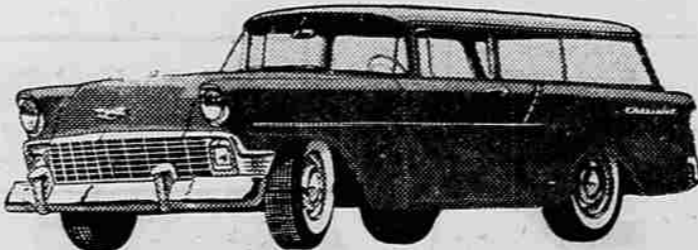
"One-Fifty" Handyman—2 Doors, 6 Passengers Choice of V8 or 6 and 3 drives in all models!