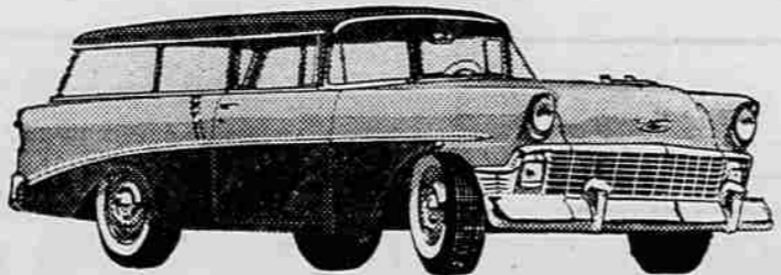
"Two-Ten" Handyman—2 Doors, 6 Passengers New colors, new two-toning in all three series!