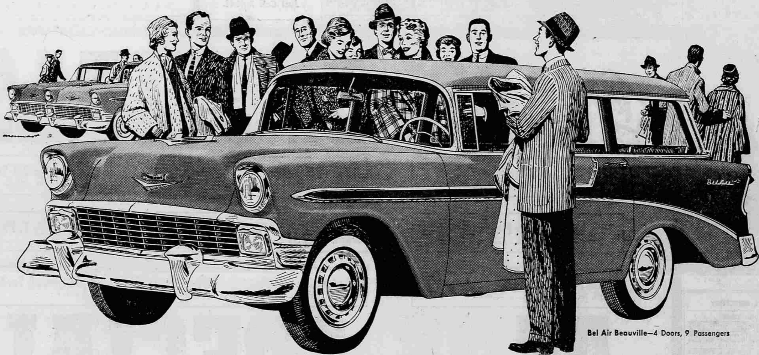
Bel Air Beauville—4 Doors, 9 Passengers

Chevrolet offers 6 sprightly new Station Wagons—all with Body by Fisher—including two new 9-passenger models!