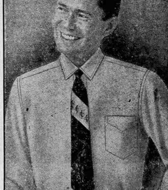
PASTEL BROADCLOTH DRESS TOWNCRAFTS®

All-purpose "T" shirt that stays in shape... with nylon reinforced collar and taped shoulder seams. Shaped sleeves for in-and-out-of-doors wear. Sizes S,M,L.