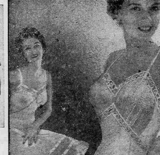
LUXURIOUS OPAQUE—No Cling DACRON®—NYLON SLIPS

Save money, work and time with Penney's Dacron® pique uniform! Whisk it through the suds, hang up to dry, don't bother to iron unless you're very fussy! Buttons down the front detach, skirt is cut generously full. Sewn with Dacron thread for strength. Stays white! Sizes 10 to 20.