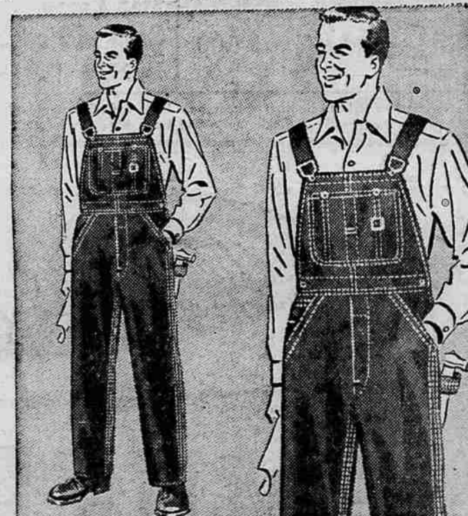
PAY DAY® UNION MADE 11¼ OZ. DENIM OVERALLS

Penney's proportion sized overalls of top quality denim, feature rigid construction... triple stitched seams and metal rivets to cope with the roughest jobs. Completely Sanforized†.