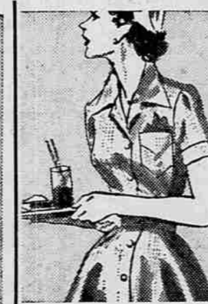
WOMEN'S DACRON PIQUE UNIFORMS

Women's better quality gowns in lively floral prints. Vat-dyed and sanforized for carefree washing. Sizes 34 to 42.