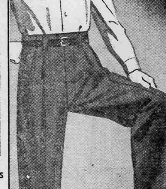
BOYS' TWILL SLACKS WITH PEG BOTTOMS!

Here are more of those wonderful receiving blankets that you use for wrapping, for the bath, for dozens of purposes throughout the day! Soft, washable cotton with sturdy stitched ends. White, pastels. 30 by 40 inches.