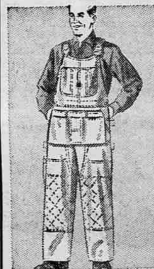
TOUGH PAY DAY CARPENTER OVERALLS