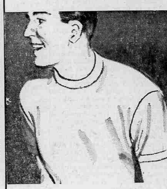
MEN'S POLO SHIRTS NOW IN NEW COLORS!

*10-oz. per sq. yd.; formerly 8 oz. per 28"x36" of fabric! Boys' T-shirts and briefs of Durene® mercerized cotton! Durene makes underwear softer, last longer! Sizes 4-16.