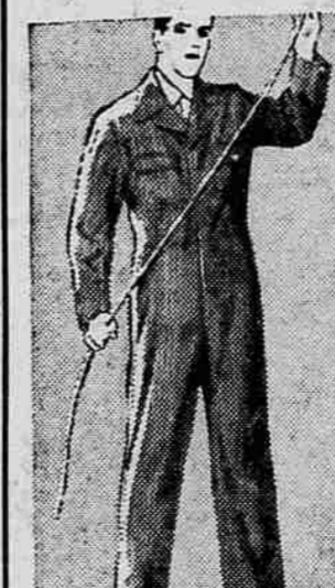
STURDY BIG MAC® WORK SUITS