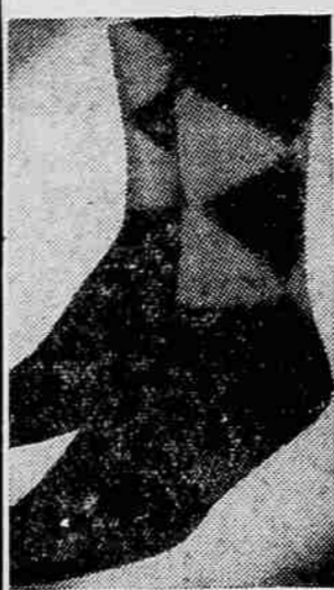
HAND FRAMED COTTON ARGYLES