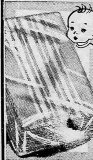
INFANTS' COTTON RECEIVING BLANKETS