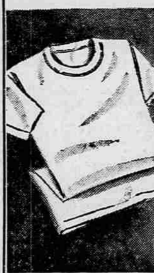
MEN'S TEE SHIRTS NYLON REINFORCED

Rich Towncraft® block argyles for men. Soft, combed cotton, nylon-reinforced at heel and toe for extra wear. Patterns can take it in the washer. Sizes 10-13.