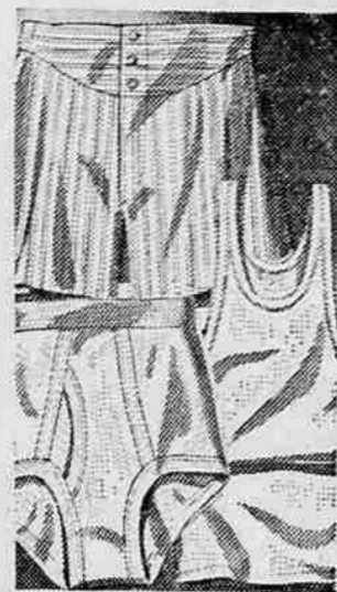
THRIFTY HIGH QUALITY UNDERWEAR

Aborbent Towncraft® underwear! Striped! Yoke-front shorts of Sanforized broadcloth ..... 69c