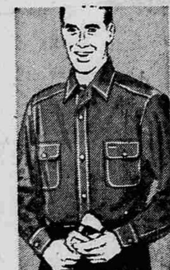
BIG MAC® CHAMBRAY WORK SHIRTS