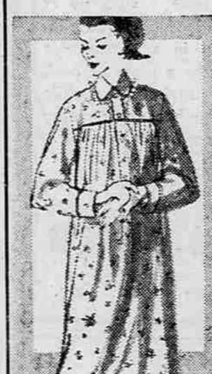
SANFORIZED COTTON FLANNEL GOWNS

60 gauge 15 denier dark seam beauties. Extra high twist dull finish nylon for extra wear and leg flattering sheerness. 3 popular shades. 8½-11.