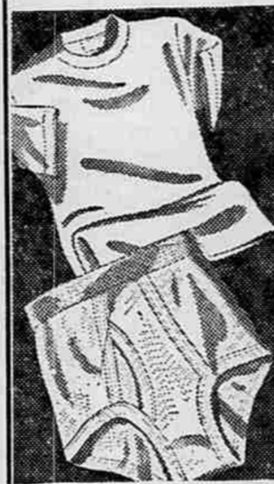
BOYS' TEE SHIRTS AND BRIEFS

Ranchcraft® extra wearing double knee Western jeans for boys' 10-oz. Sanforized denim, double thick where it counts. Reinforced construction. Zipper. Sizes 4-16.