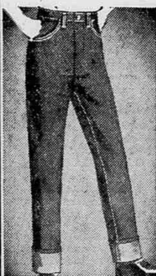
BOYS HEAVY 13-OZ. DENIM JEANS

Sanforized denim jackets built to take it... western styling in 11-oz. denim. Sizes 6-16.