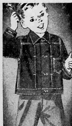
BOYS' 11-OUNCE DENIM JACKETS