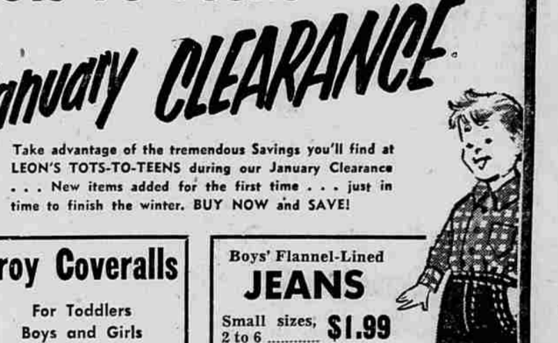
HIGHEST QUALITY AT LOWEST PRICES

REG. $19.95 Now $17.95 Other Screens from $15.95