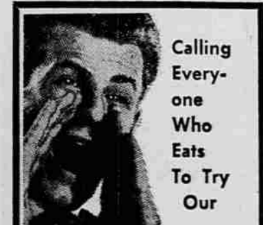
Calling Everyone Who Eats To Try Our