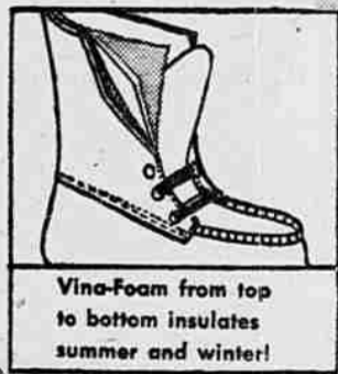
Vina-Foam from top to bottom insulates summer and winter!

OUTDOOR MEN, GET LIGHTWEIGHT WARMTH IN FINE QUALITY PENNEY FOREMOST® BOOTS!